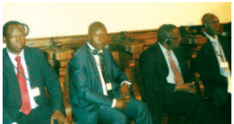
Some members of the LCBC delegation