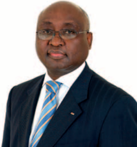
Dr. DONALD KABERUKA President of the AfDB since 2005