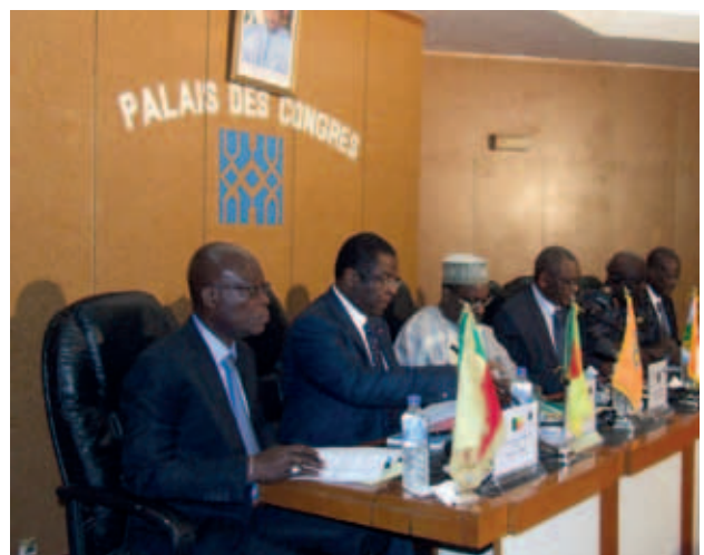
An attitude of Ministers of Defence during the solemn opening ceremony