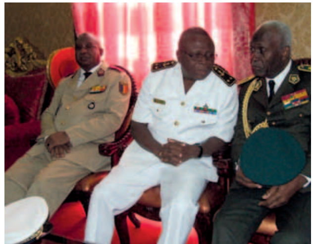
Used consultation between Chiefs of Staff; CEMA here in Cameroon with that of Benin.