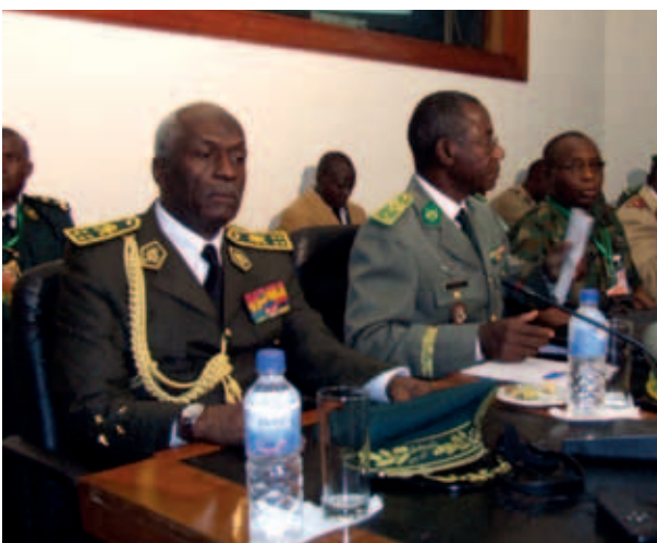
An attitude of Chiefs of Defence Staff at the opening ceremony.