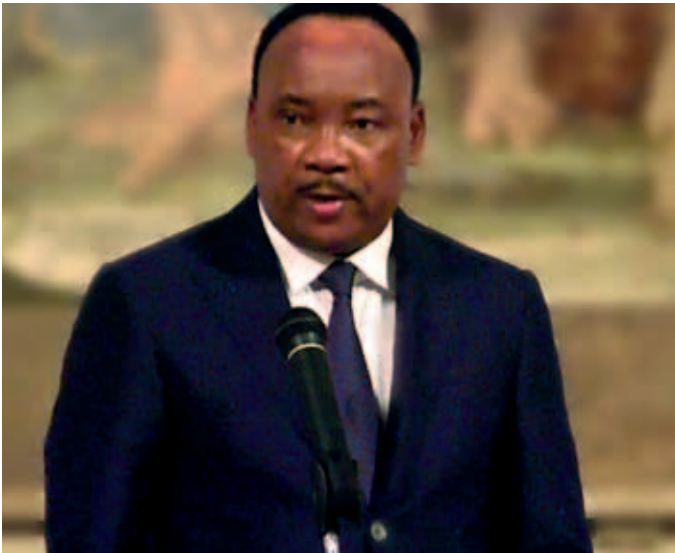
H.E. Mr. Issoufou MAHAMADOU President of the Republic of Niger and Current Chairman of the LCBC Summit of Heads of State and Government