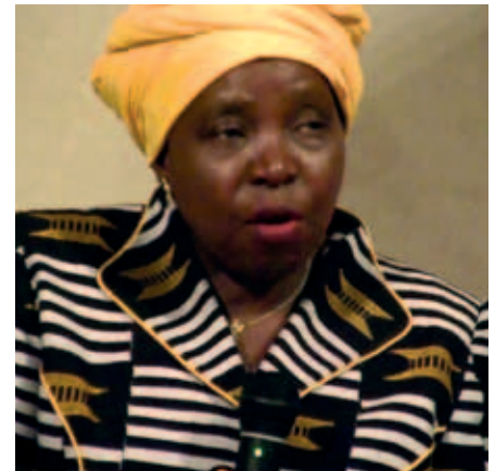
Mrs. Nkosazana Dlamini ZUMA Chairlady of the African Union Commission