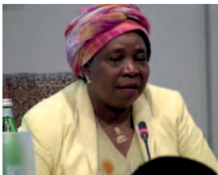
Mrs Nkosazana Dlamini ZUMA Chairlady of the African Union Commission

“ Lake Chad is one of the undeniable images of devastating effects of environmental degradation and climate change in Africa. These impact on the productivity of populations and natural ecosystems. We have to overcome these challenges to reverse the trend. This Five-Year Plan is an adequate response to these challenges. »