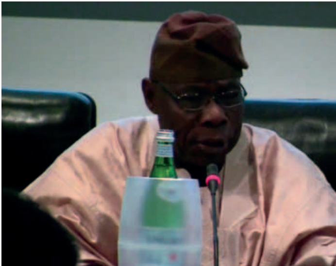
H.E. Mr. Olusegun OBASANJO Champion of the Round Table