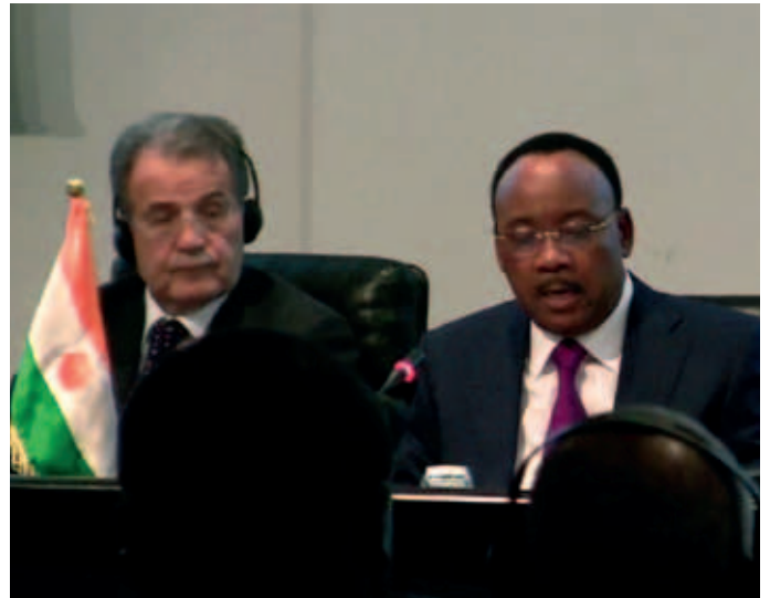
Mr. Romano PRODI and H.E. Mr. Issoufou MAHAMADOU, President of the Republic of Niger