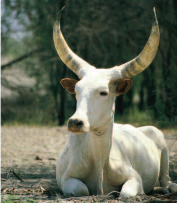
The Kouri cow