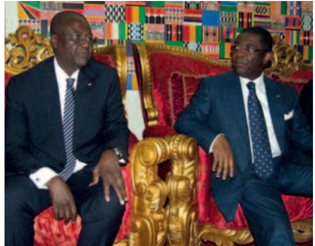
Exchanges between the Minister Delegate at the Presidency in charge of Defence of Cameroon and his counterpart from Chad.