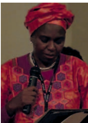
Mrs. Sarah RENG OCHEKPE Federal Minister of Water Resources of Nigeria