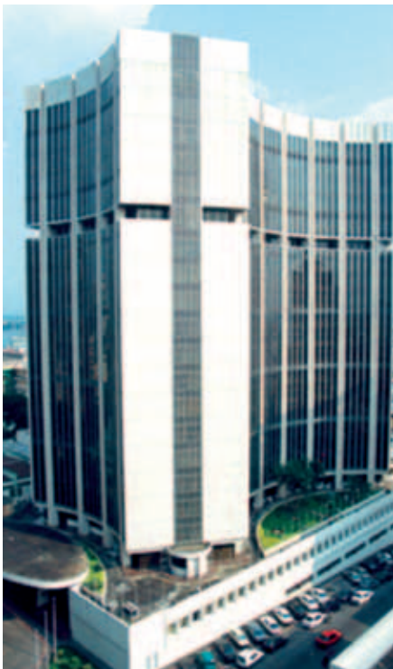
The Headquarters of the Bank in Abidjan

The African Development Bank, AfDB which is the Leader of the LCBC Donors' Conference, was established on September, 1964 and has as a President Dr. Donald KABERUKA since 2005. The Headquarters of the Bank are located in Abidjan, Cote d'Ivoire.