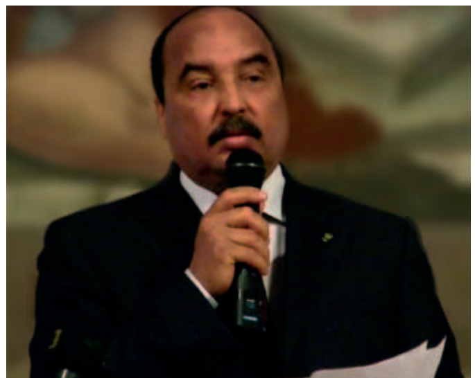
H.E. Mr. Mohamed Ould ABDEL AZIZ, President of Mauritania, current Chairman of the Summit of Heads of State of the African Union,