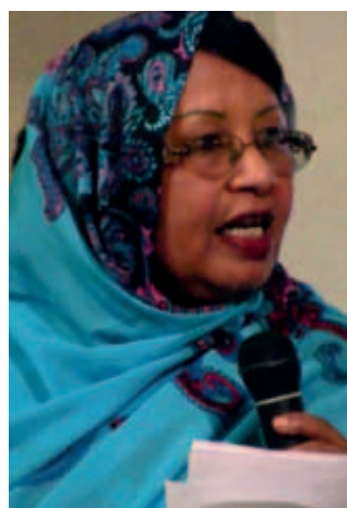
Mrs. Mariam Mahamat NOUR Minister of Economy, Planning and International Cooperation of Chad