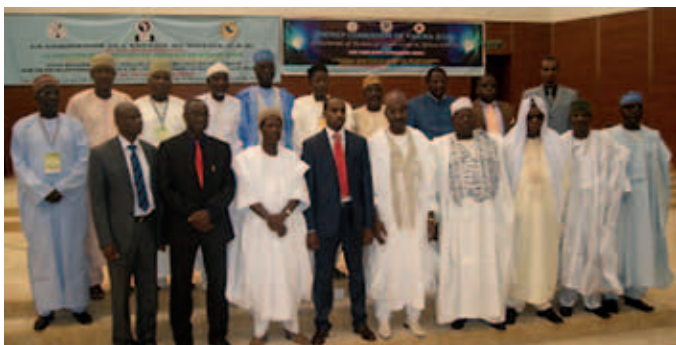
Participants at the opening ceremony.

The Energy Commission of Nigeria (ECN) in collaboration with the Directorate of Technical Cooperation in Africa (DTCA) and the Lake Chad Basin Commission (LCBC) organized a regional sensitization workshop on sustainable energy development in the Lake Chad region, from 16th to 19th July 2014 at the International Conference Centre (Palais du 15 janvier) of Ndjamen, Chad Republic. This workshop fall in line with two other meetings held in 2009 and 2011. The aim of this workshop is to launch the Pilot Project on the popularization of 100 energy efficient woodstoves and 10 solar PV powered water boreholes in the Lake Chad basin in order to provide solutions to the issue of sustainable energy utilization in the Lake Chad basin, focus was put on the promotion of green energies in the Lake Chad basin area.