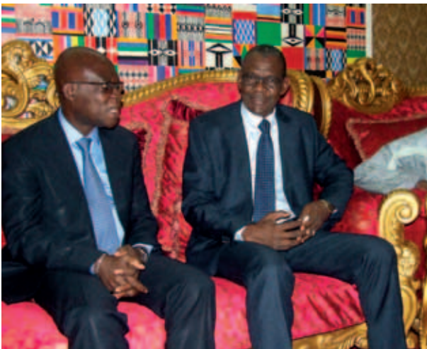
The Minister of National Defence of Niger talking to his counterpart from Benin.