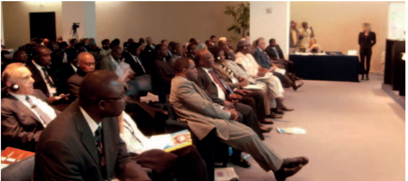
A cross-section of the panelists during the Round Table